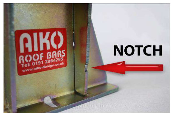
...and rear left side of vehicle.

Correspondingly, the notches on the right hand side will be on the leading edge at the front, and the trailing edge at the back. (Where fitted, all the middle brackets require is for the ' AIKO ' stickers to be facing outwards; this will also enable passers-by to see where you got such a fabulous product).